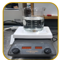
Keep water boiling during incubation.