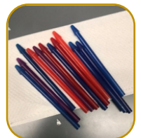
Use a clean pestle for each arthropod.