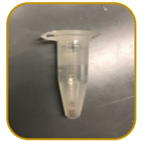
Samples should be small enough to fit in the bottom of a tube.

Note 2.1: DNA precipitates in the presence of alcohol. Therefore, remove as much preservative as possible. If the arthropod is large or has a thick/tough exoskeleton, dissect out the reproductive tissues.