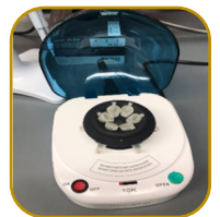
Centrifuge at 10,000 x g or use the default high speed.